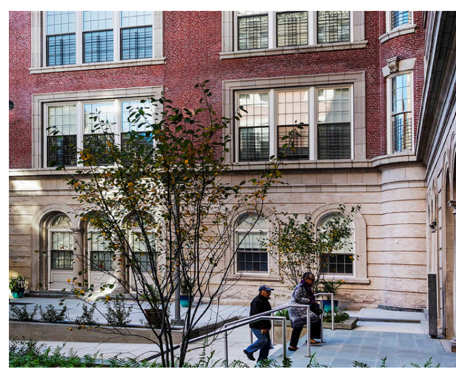
PS 186 Boys & Girls Club of Harlem, Low Income Rehab