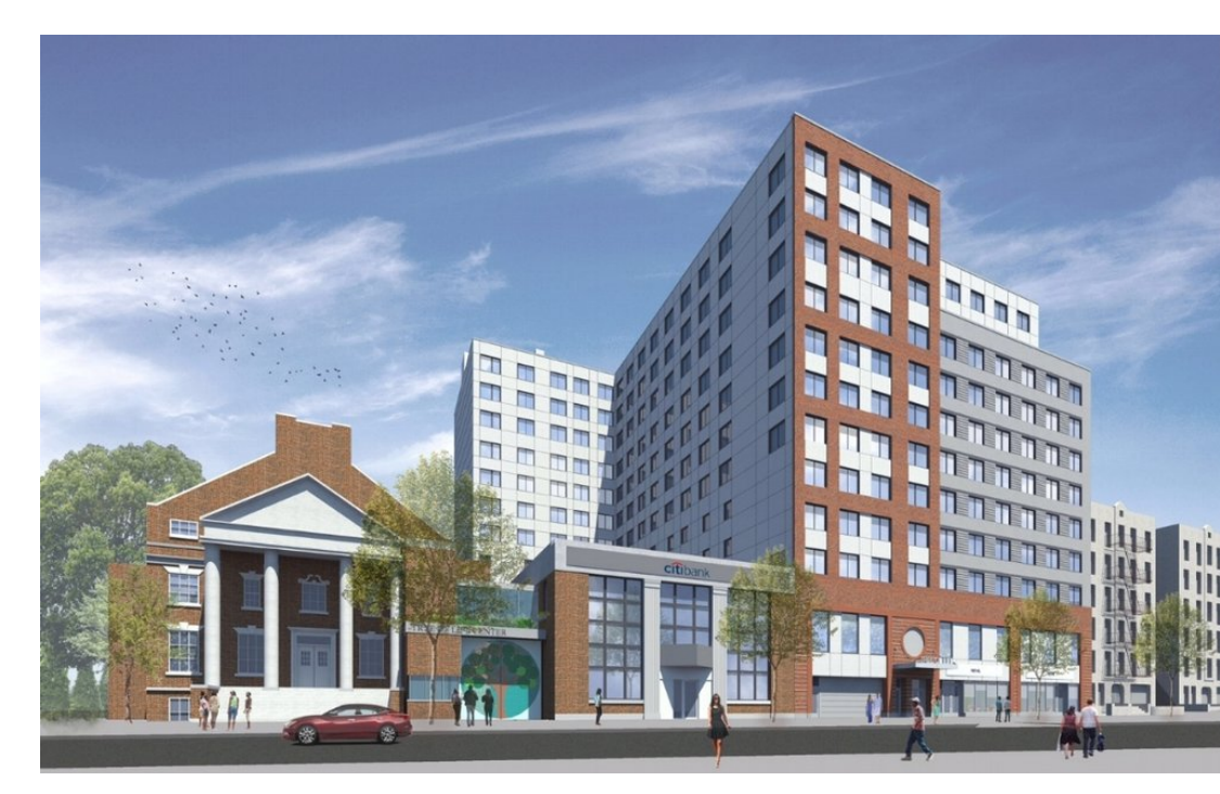
Tree of Life; 174 Units in Jamaica, Queens